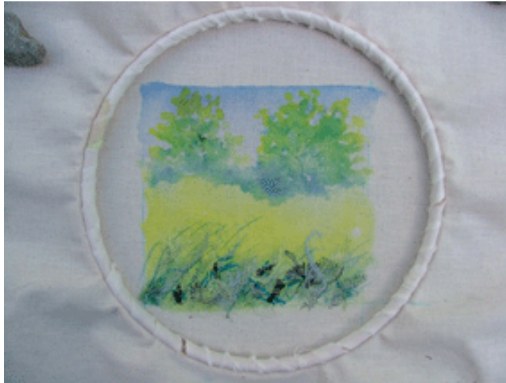
Figure 4: Bonding