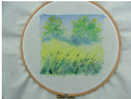
(a) Hand Stitching