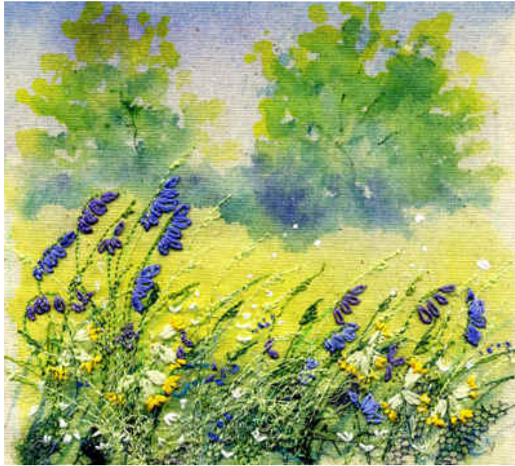
Figure 1: The final project