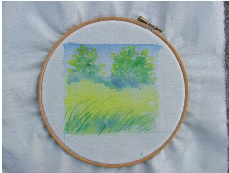
Figure 3: Further Painting