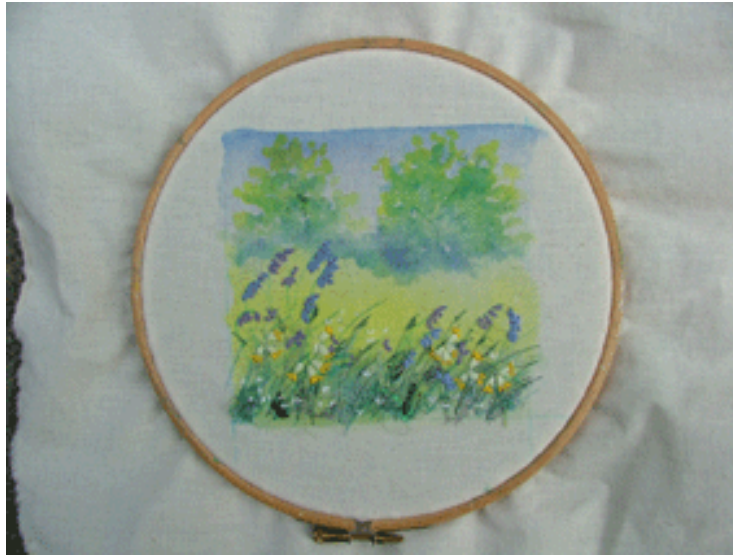
Figure 6: Ready for framing